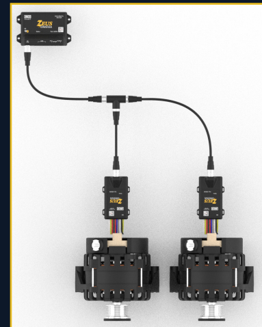
Single or multiple installations of alternators are made safe, cost effective and easy with unique CAN messaging for each alternator.