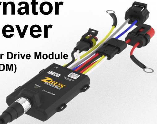
The Alternator Drive Module (ADM)