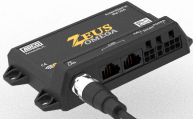
The Control Module