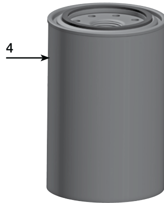
S3230P Filter sold separately. Only Item parts 1-3 are included in the RK12963.