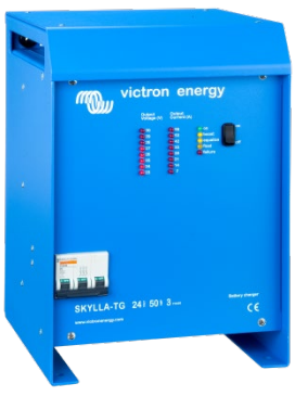
Skylla TG 24 50 3 phase