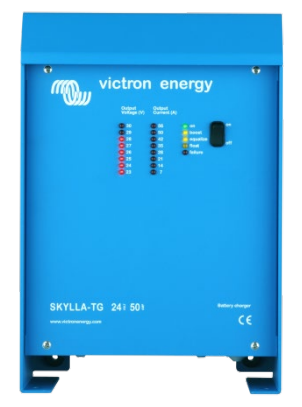
Skylla TG 24 50