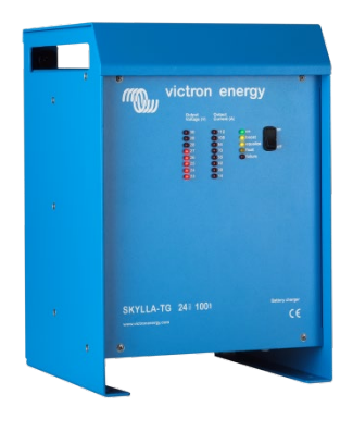
Skylla TG 24 100